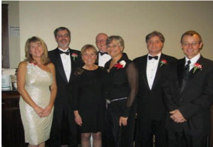
The 2012 Officers of the Chautauqua County Board of REALTORS®, Inc. were installed Thursday, November 10, 2011 during a dinner held at LaScala's Restaurant.