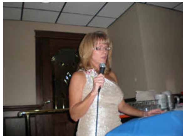
Ready, Willing and Able President!