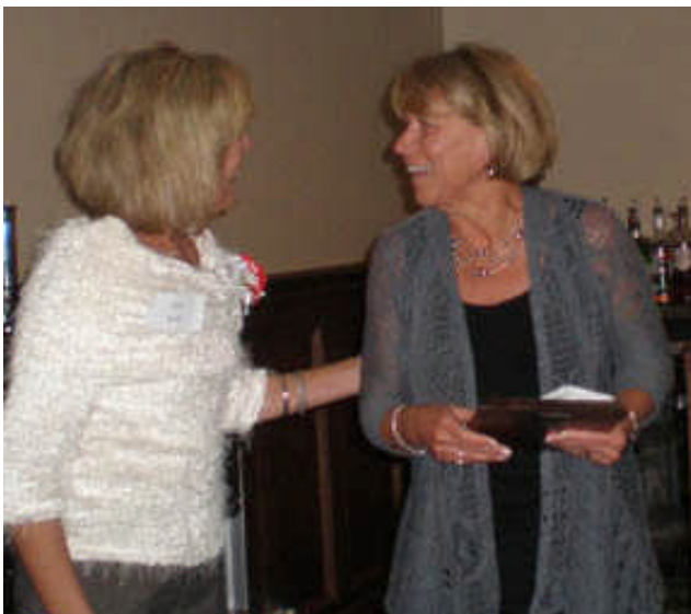
2011 REALTOR-ASSOCIATE® of the Year