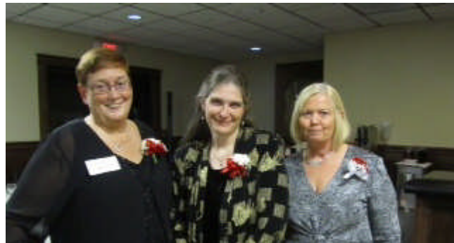
Super Duper Staff!

Thank you to all who attended and supported the Board. It was a wonderful evening with wonderful food and wonderful people!