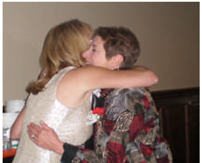
2011 REALTOR® of the Year